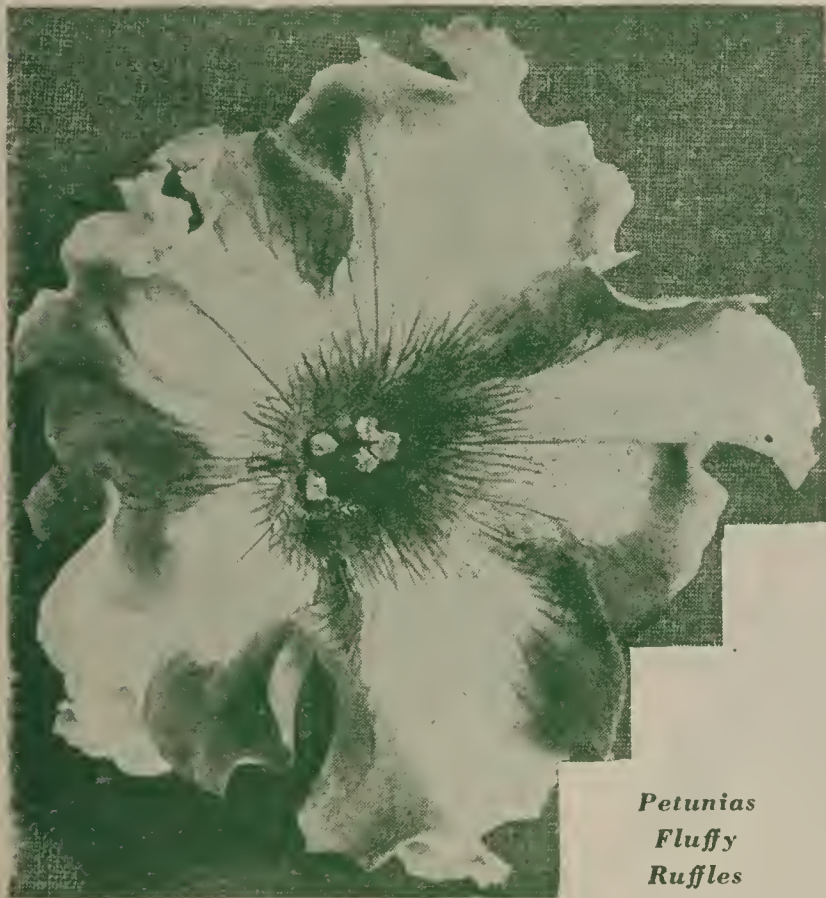
Petunias Fluffy Ruffles

A superb strain of single petunias, the most deeply ruffled and fluted of all. Exceedingly delicate and graceful. Mixed. 100 SEEDS 20c; 500 SEEDS, 80c.